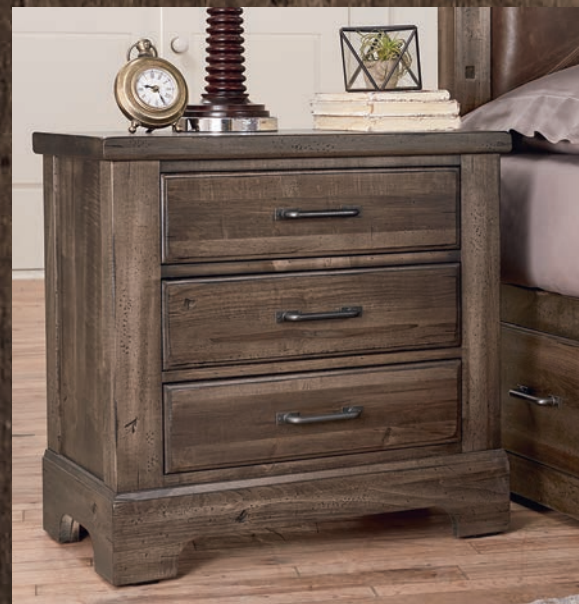
170 MINK FINISH -227 NIGHT STAND - 3 DRAWERS