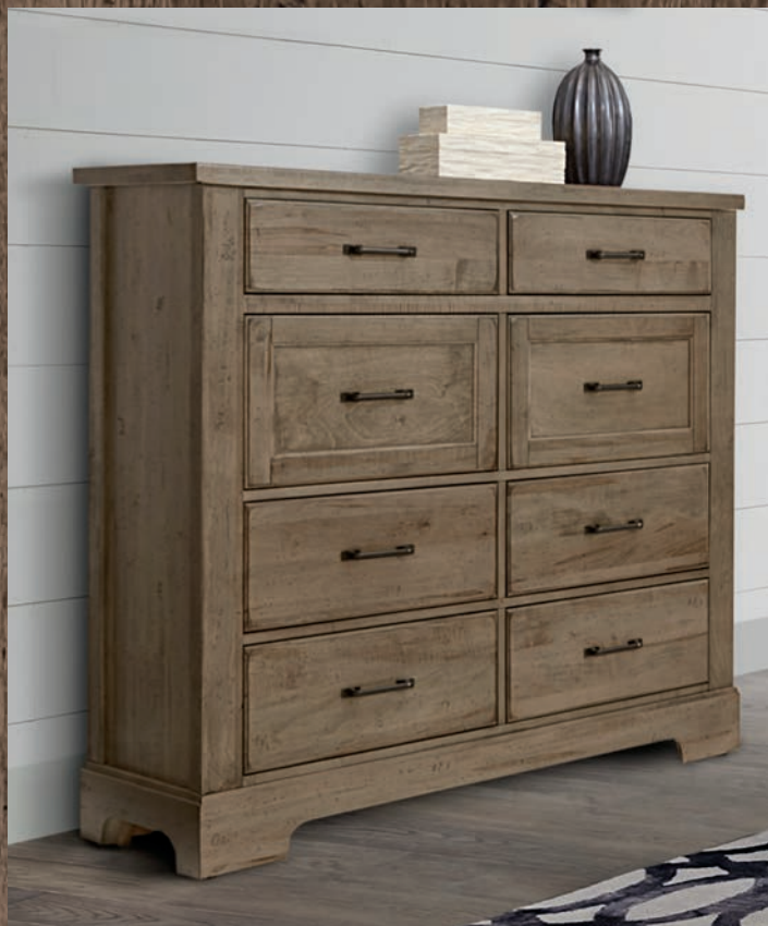
172 STONE GREY FINISH -004 LINEN CHEST - 8 DRAWERS