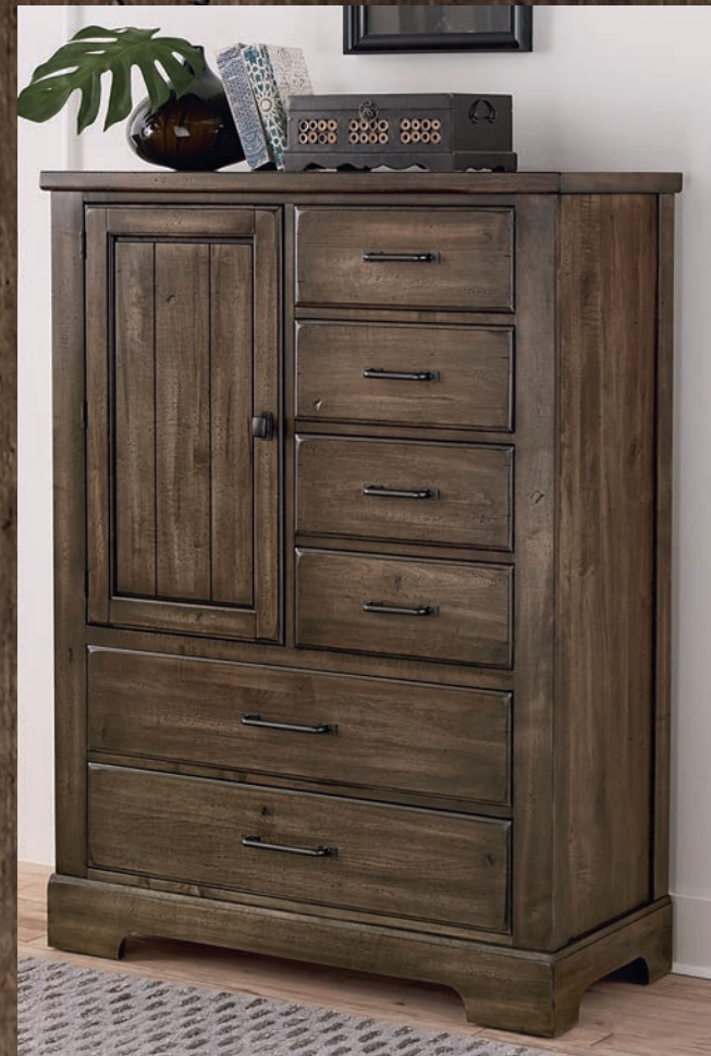
170 MINK FINISH -117 STANDING CHEST - 6 DRAWERS 1 DOOR WITH FIXED SHELF