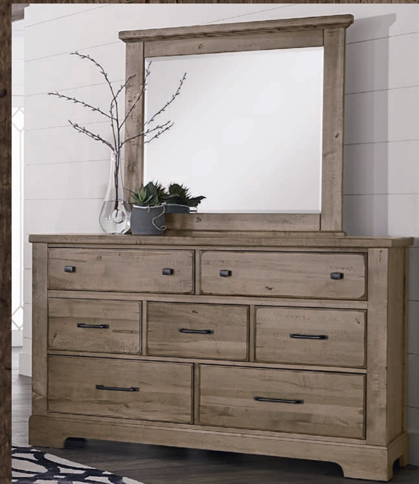
172 STONE GREY FINISH -002 DRESSER - 7 DRAWERS -446 LANDSCAPE MIRROR - BEVELED GLASS

Cool Rustic is the perfect combination of quality construction, honest styling, and updated finishes that will look good in any home. The dresser, chests, and nightstand all use a combination of industrial styled bar pulls and knobs