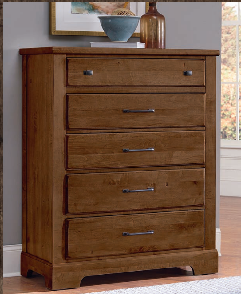
174 AMBER FINISH -115 CHEST - 5 DRAWERS